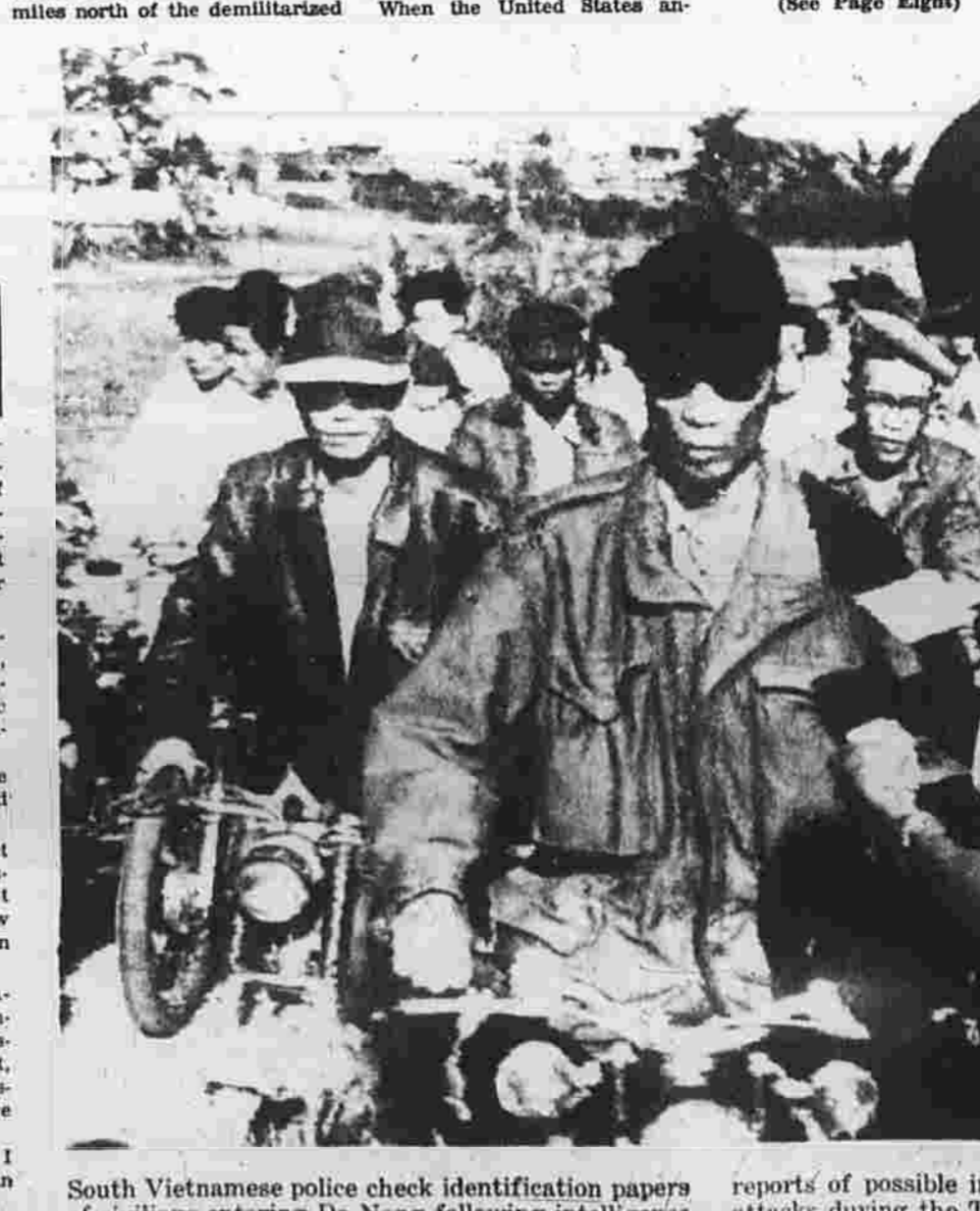
South Vietnamese police check identification papers of civilians entering Da Nang following intelligence reports of possible increase of Viet Cong terrorist attacks during the Tet Lunar New Year.

SAIGON (AP) — America's southern zone between North and South Vietnam, the Tet offensive, has been halted by allied forces.